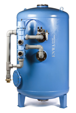
Sandfilter SA-1000 Thermoplastic coated vessel Automatic back flushing